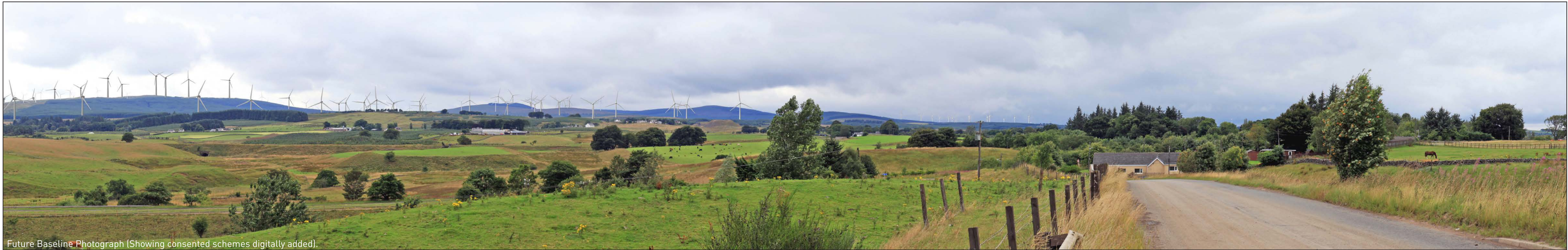
Future Baseline Photograph (Showing consented schemes digitally added).