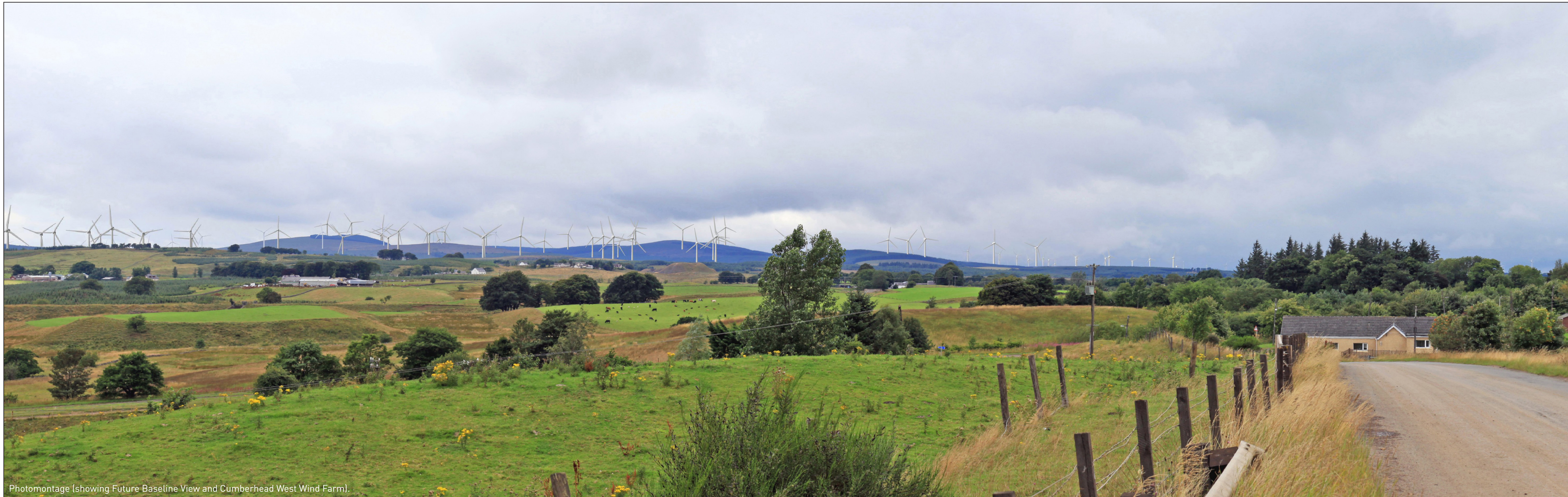
Photomontage (showing Future Baseline View and Cumberhead West Wind Farm).